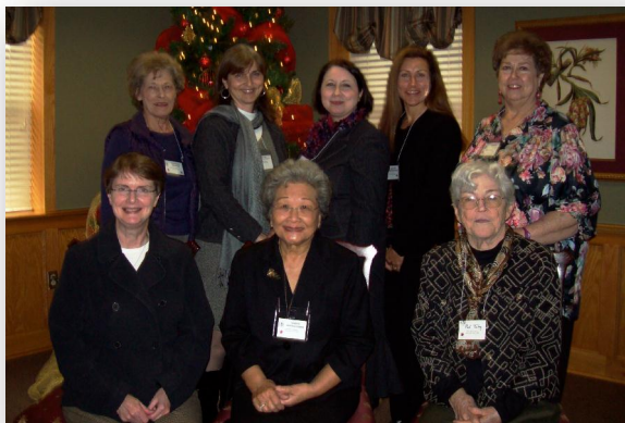
MMTA Past Presidents' Luncheon