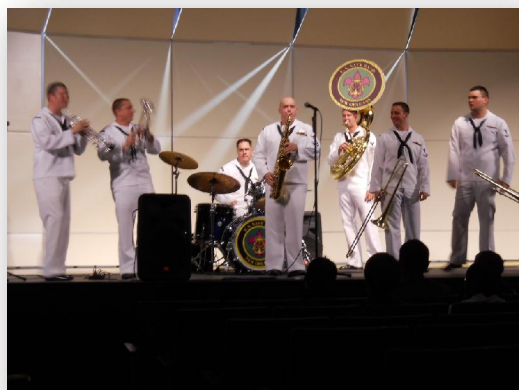
The Brass Band from the U.S. Navy Band, New Orleans