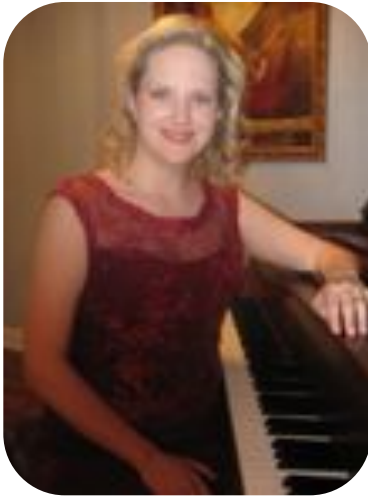
Ellen Price Elder