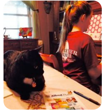
Tucker, my faithful teaching assistant